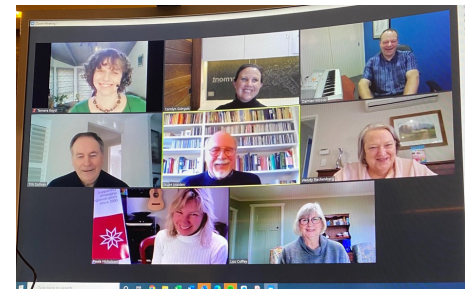
On-line grant interview panel