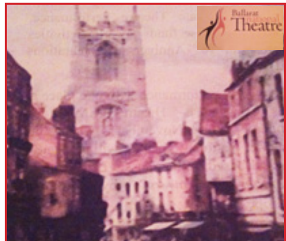
"Barchester" a musical based on 'Barchester Towers' by Anthony Trollope.